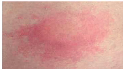
Typical picture of a local reaction 10 hours after injection.

The edge of the local reaction becomes smoother after approx. 4 hours. It may itch again.