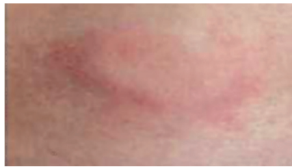
Typical picture of a local reaction 4 hours after injection.