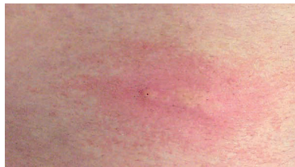
Distinct skin reddening directly after the injection.